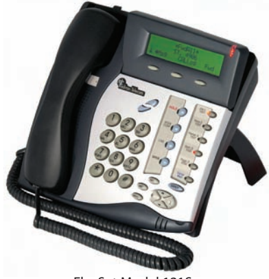
FlexSet Model 121S