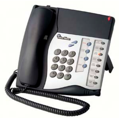
FlexSet Model 120