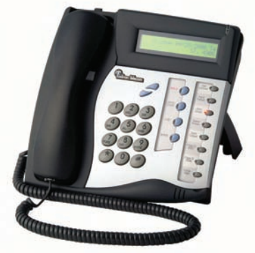
FlexSet Model 120D